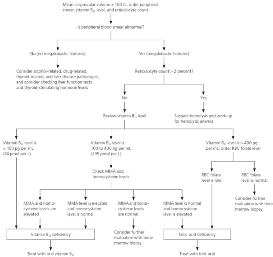
Figure 3. Algorithm for the evaluation of macrocytic anemia. (RBC = red blood cell; MMA = methylmalonic acid.)